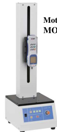
Motorized stand MODEL-1308U